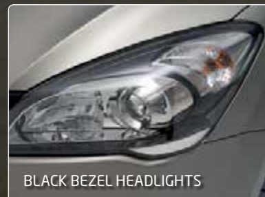
BLACK BEZEL HEADLIGHTS