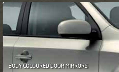
BODY COLOURED DOOR MIRRORS

Developed as the ultimate incarnation of the stylish and dynamic second generation Kia cee'd_sw, the elite features a simply incredible level of standard specification. Add up the cost of features like Bluetooth®, automatic rain sensors, cruise control, 16" alloy wheels, dual control air conditioning, steering wheel audio controls and all-round electric windows on competing models and you'll discover that the elite is a truly compelling offering. Add in great fuel economy and Band B road tax, and you know you're onto a winner.