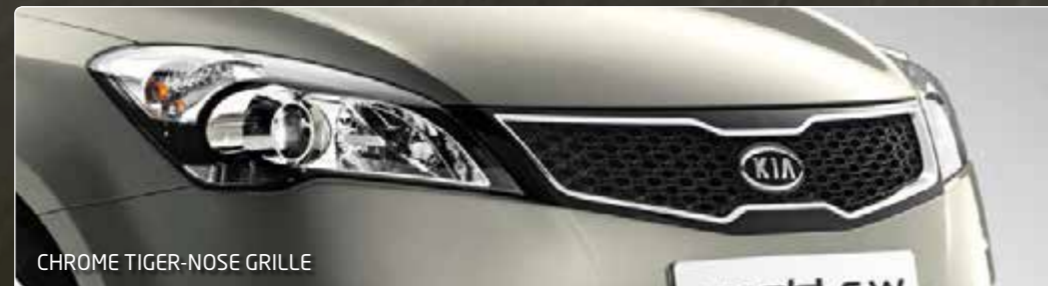
CHROME TIGER-NOSE GRILLE