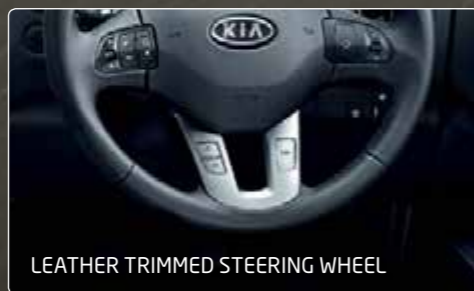
LEATHER TRIMMED STEERING WHEEL