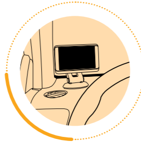
1. Navigation SNAP & DRIVE Basic Kit 55690ADE00