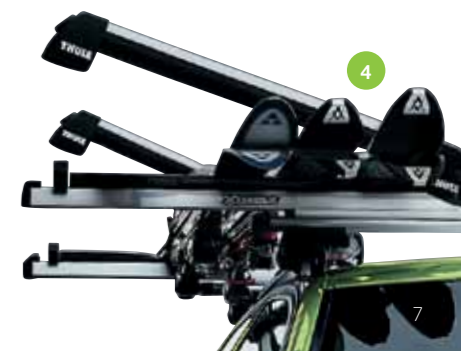
4. Ski & snowboard carrier Thule Xtender 739 (5dr) Comfortable for winter season. Perfect for 6 pairs of skis or 4 snowboards. The carrier slides out for easy loading and unloading without having to stretch over the car roof and risk getting your clothes dirty or scratching your Picanto. 55700SBA10