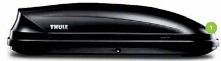
1. Roof box Thule Pacific 200 (5dr) 460 litre box with a lowered base for reducing air resistance, wind noise and vibrations. 55730SBA20

Although the Picanto is a space miracle, it is not unusual that the trunk capacity might be too small for bulky items like sports equipment. With Thule transportation solutions you are well equipped for any mission.